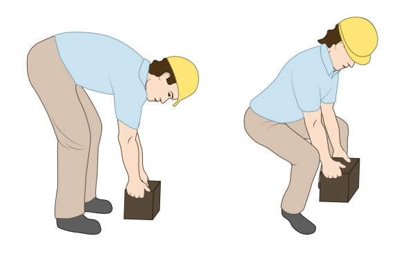
Use the muscles in your legs to help lift a heavy item.

Disk replacement. This procedure involves removing the disk and replacing it with artificial parts, similar to replacements of the hip or knee.