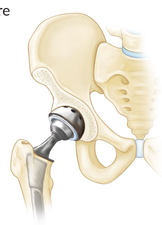
A total hip replacement

Joint replacement. This surgery removes the damaged joint and replaces it with an artificial device.